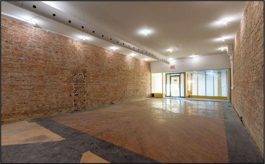
Our new space in Belleville, just south and across the street from our current space at 221 Front St, will be taking shape over the next few months.