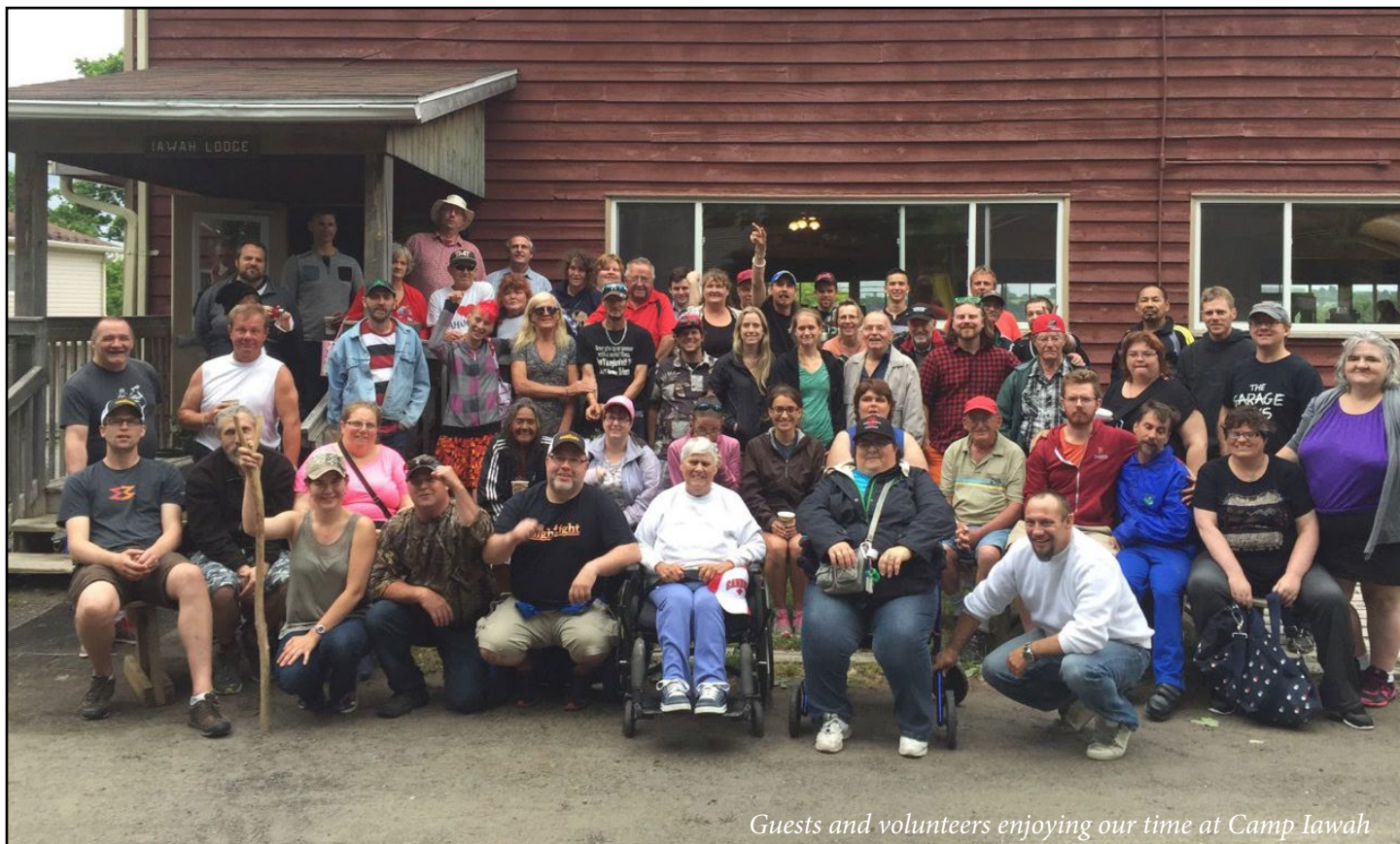
Guests and volunteers enjoying our time at Camp Iawah